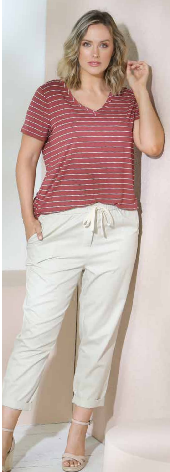
PHOTO 1 CAMERON TEE Poly/rayon/elastane Brick, Navy Size: 6 to 28 $79.95